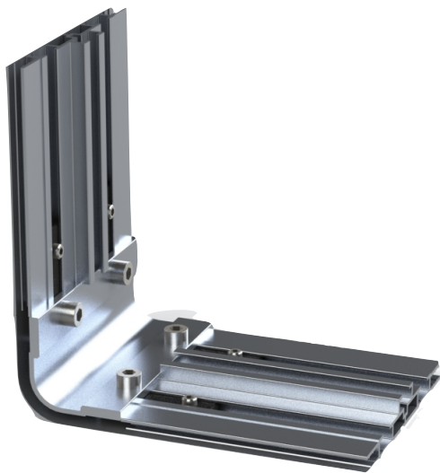
Rounded Corner with Double side 100mm Profile