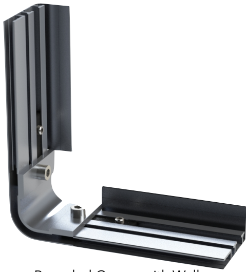
Rounded Corner with Wall Frame 50mm Profile