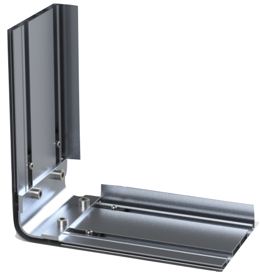
Rounded Corner with Wall Frame 100mm Profile