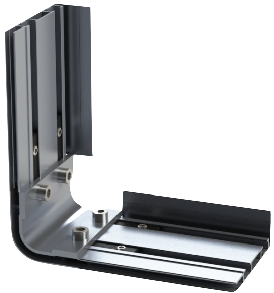
Rounded Corner with Wall Frame 75mm Profile